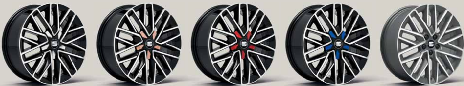
Diamond cut in Silver St XE FR Diamond cut in Mystic Magenta St XE FR Diamond cut in Desire Red St XE FR Diamond cut in Mystery Blue St XE FR Diamond cut in Cosmo Grey St XE FR