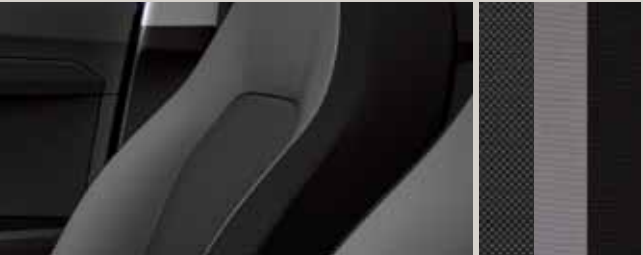
Cloth Orgad Grey/Ice Touch CB St