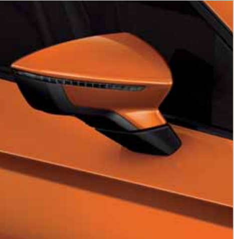
Eclipse Orange 2 R St FR