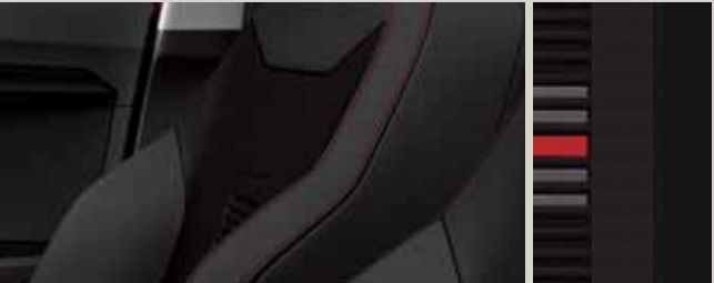
Cloth Sound/Hill/Nora FR FL FR