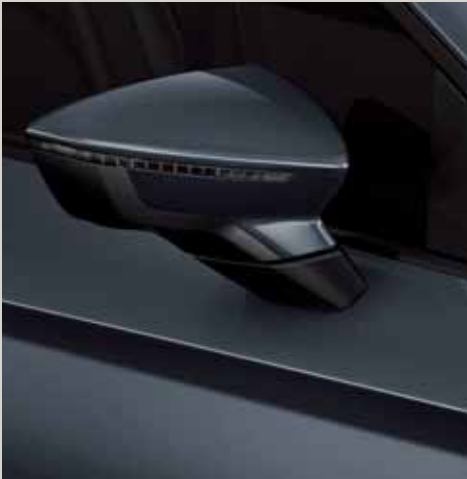
Magnetic Tech 2 R St XE FR