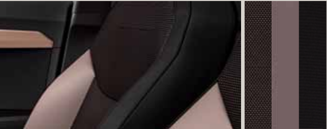
Cloth Edge Mystic & Plus Mystic /Clip Titan Black DL XE