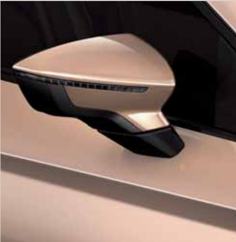
Mystic Magenta 2 R St XE