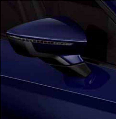
Mediterraneo Blue 1 R St XE FR