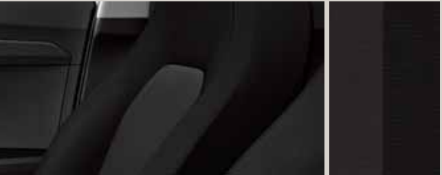
Cloth Plus Acero/Clip Titan Black AF R