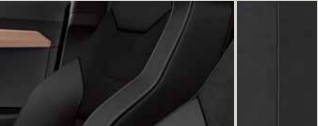
Dynamic Black DL + PL7 XE