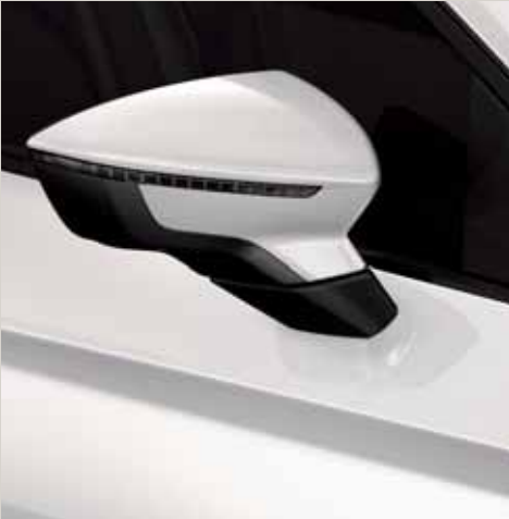
Candy White 1 R St XE FR