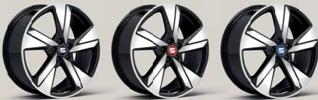
Diamond cut in Piano Black St XE FR Diamond cut in Desire Red St XE FR Diamond cut in Mystery Blue St XE FR

Reference R Style St Xcellence XE FR FR Standard ■ Optional ■