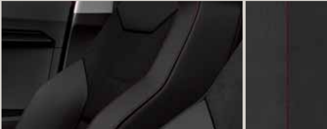
Dynamic Black FL + PL7 FR