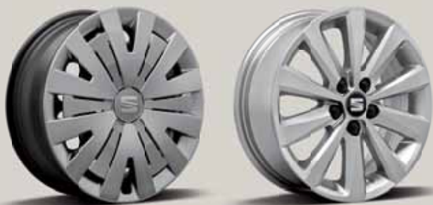
Urban R St Enjoy R St XE