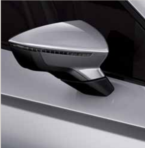
Urban Silver 2 R St XE FR

Reference R Style St Xcellence XE FR FR Optional