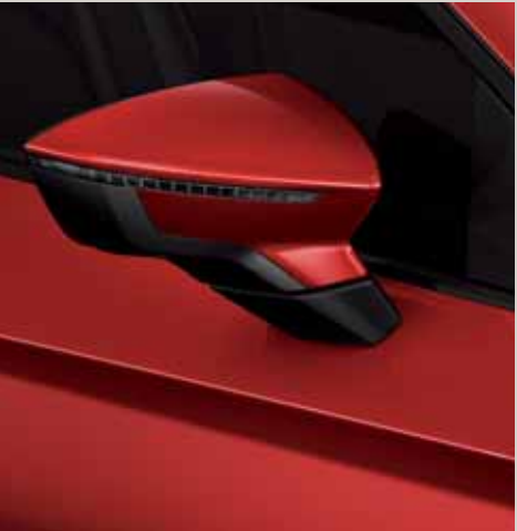
Desire Red 2 R St FR