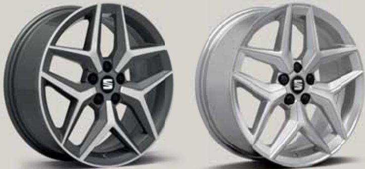
Dynamic Machined XE Dynamic FR