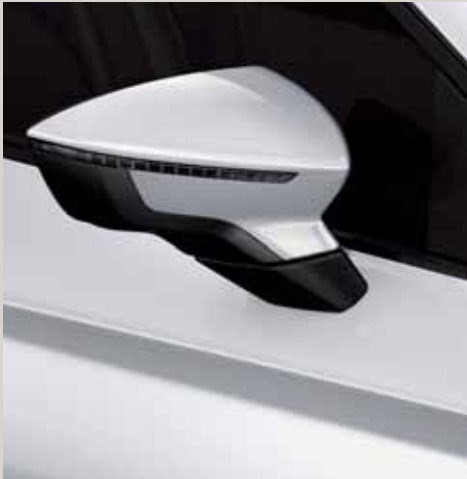
Nevada White 2 R St XE FR