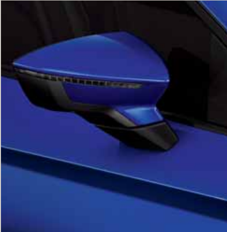
Mystery Blue 2 R St FR