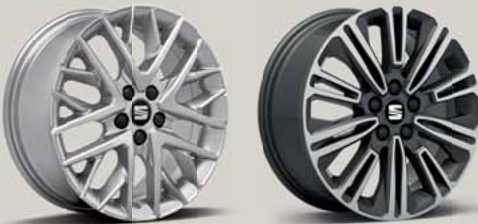
Design St Design Machined XE