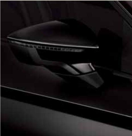
Midnight Black 2 R St XE FR