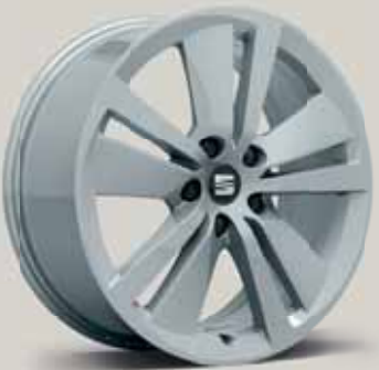
Dynamic Grey R St FR