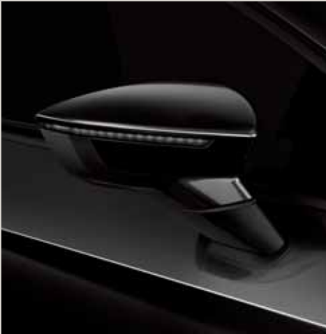
Midnight Black 2 R St XE FR XP CU