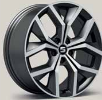
Performance Machined Atom Grey XP