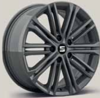
Dynamic 30/1 XE