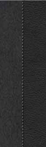
Alcantara® Black Sport seats CE + WL3'