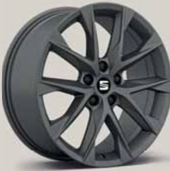
Performance Machined Atom Grey XP