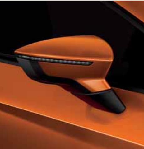
Eclipse Orange 2 R St XE FR XP