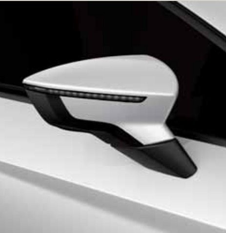
White 1 R St XE FR XP