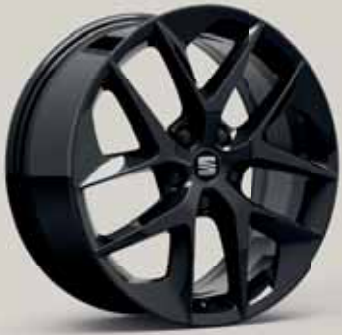
Black R St FR