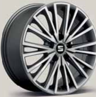
Dynamic 30/4 Atom Grey St