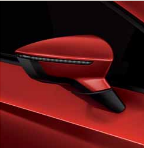
Desire Red 2 R St XE FR CU