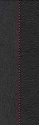
Alcantara® Black Sport seats GE + WL3'