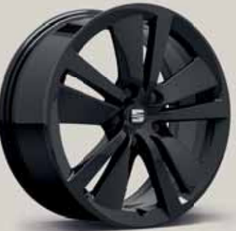
Black R St FR