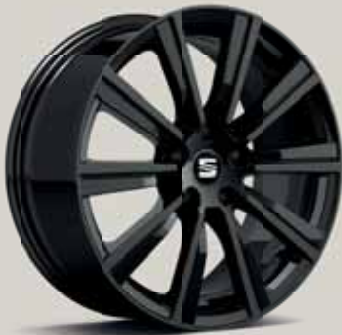
CupRacer Black R St FR