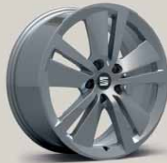
Anthracite R St FR