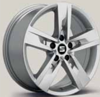
Dynamic 30/2 FR