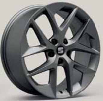
Titanium Grey R St FR