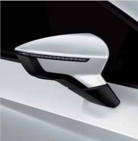
Nevada White 2 R St XE FR XP CU