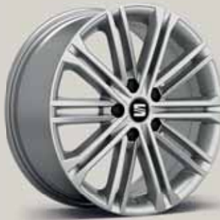
Dynamic 30/1 XE