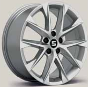
Performance 30/1 FR