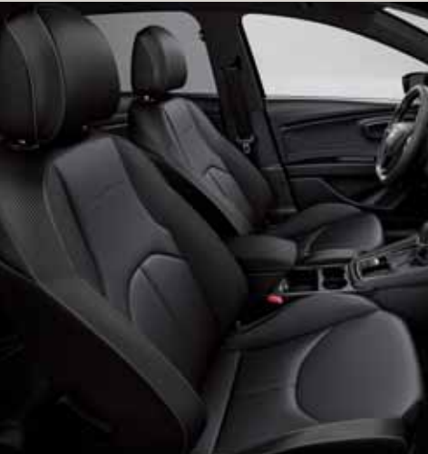
Leather Black Sport seats LE + WL1