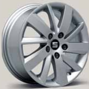
Design 30/1 Reference