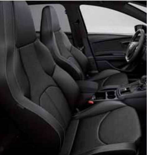
Bucket seats LE+PL6