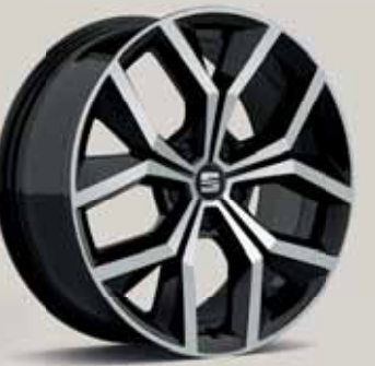
Black X-PERIENCE XP