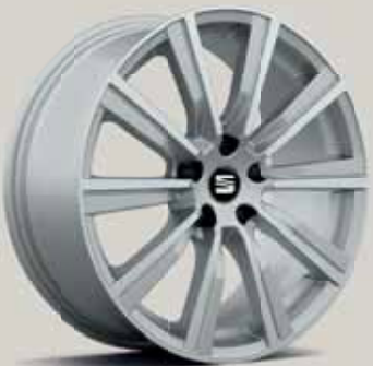
CupRacer Grey R St FR