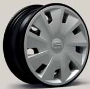
Urban 30/1 Reference