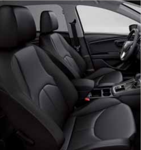
Leather Black Sport seats AD + WL1