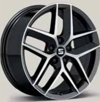
Performance 30/2 Machined FR