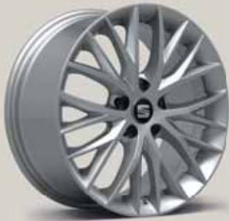
Dynamic 30/3 St