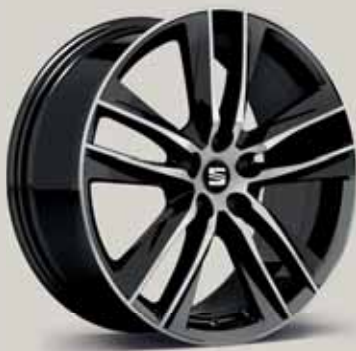
CUPRA 30/2 Black High Gloss CU