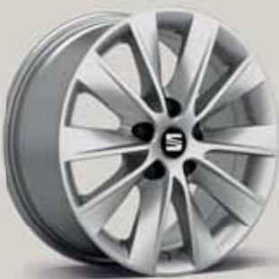
Design 30/2 Style