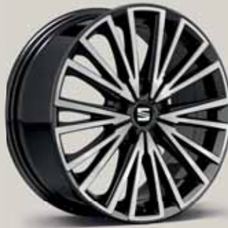
Dynamic30/4 Black High Gloss XE