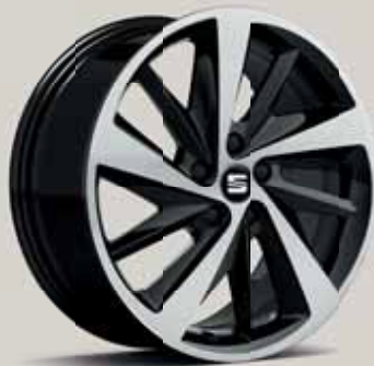
Black Machined R St FR