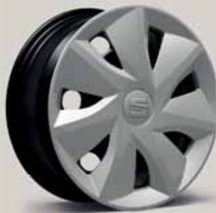
Urban 30/1 Reference