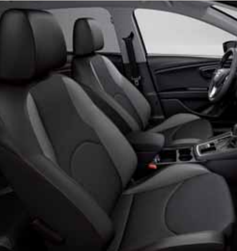
Cloth Germe Sport seats AD