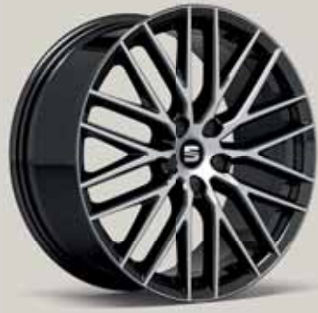
Black Performance FR CU