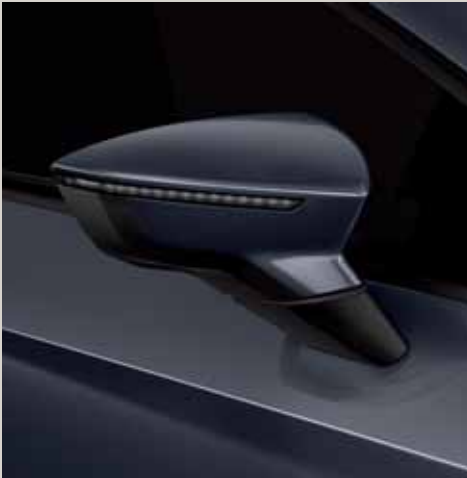
Magnetic Tech 2 R St XE FR XP CU