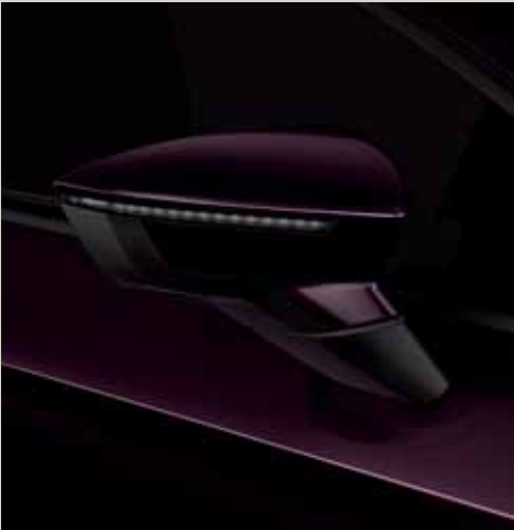
Boheme Purple 2 R St XE FR