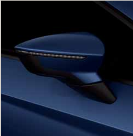
Mediterraneo Blue 1 R St XE FR XP CU