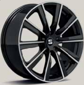
CupRacer Black FR CU