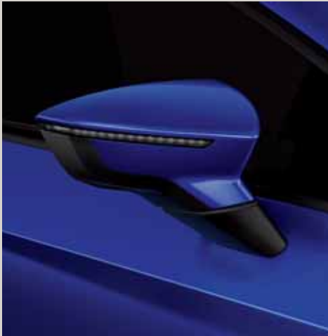
Mystery Blue 2 R St XE FR CU

Reference R Style St Xcellence XE FR FR X-PERIENCE XP CUPRA CU Standard ■ Optional ■